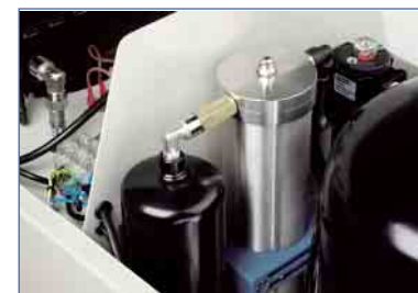
Integral Air Dryer