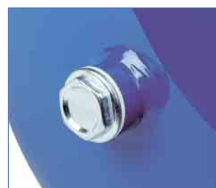
Internally Coated Receiver