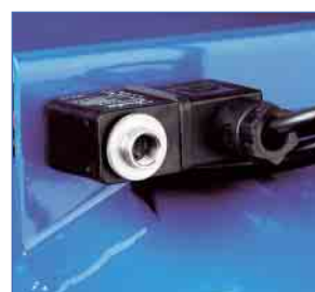
Soft Start Valve