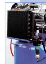
After Cooler & Coalescing Filter